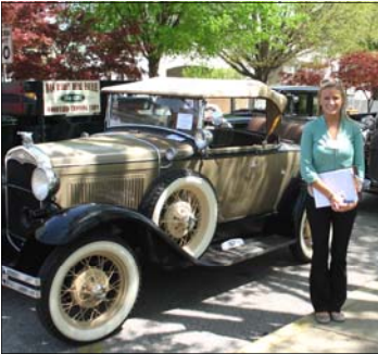
April Vintage Car show: Traffic Jam on 6th Street