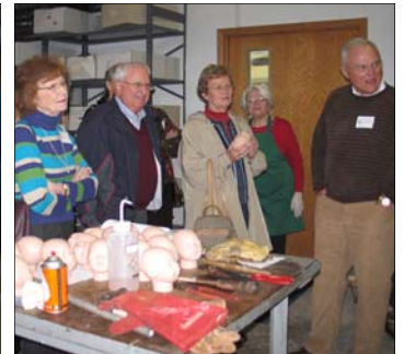
November Tour of Turner Doll Factory