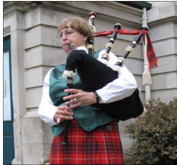
May Scottish Society Community Voices Reception