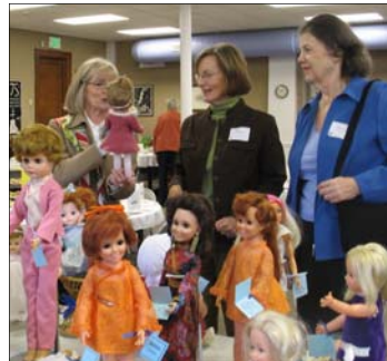
October Tea Party Benefit & Vintage Doll Sale