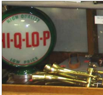
September “Carburetors, Hubcaps & Bloomington’s First Cars” Exhibit