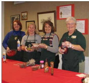
January Week of Chocolate: Sundaes on Saturday