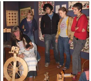
March Craftacular: A Spectacular Craft Event