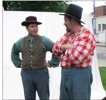
June Civil War Encampment