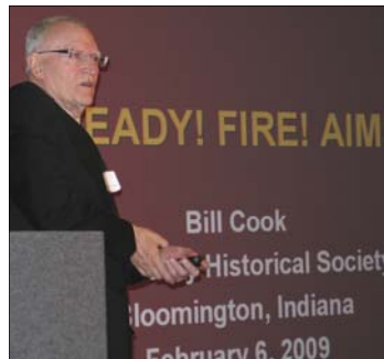
February Gala at COOK World Headquarters