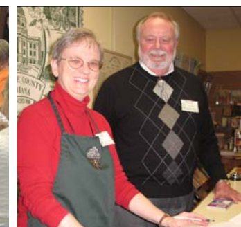
November Volunteers assist in the Gift Store during the Canopy of Lights Open House