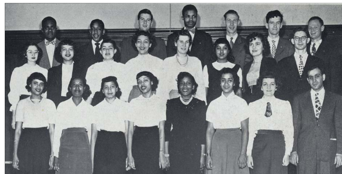
NAACP group photo from the 1949 Arbutus originally exhibited in, “Freedom: A History of Us.” The 1949 Arbutus was the first issue where any African-American group was featured in its pages and the NAACP also holds the title as being first non-Greek organization to be featured. Its members were four fifths White and one fifth Black.