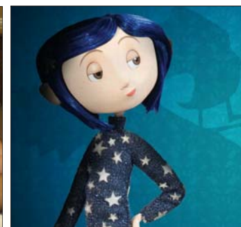
January The Art of Miniatures featured the locally-made, micro-knit prop sweater from the movie Coraline