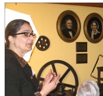
April Annual Meeting and Seward Portrait Restoration Celebration