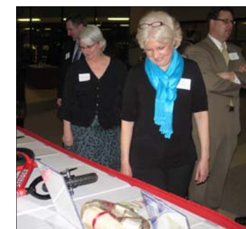
February Silent Auction at the 3rd Annual Benefit Gala