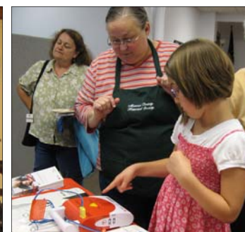
May Monroe County Red Cross Exhibit Opening