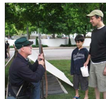
August Annual Civil War Encampment