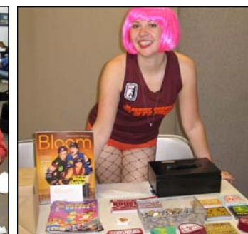
July Bleeding Heartland Roller Derby Exhibit Opening