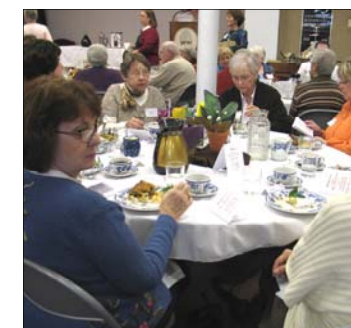
October Kaffee Klastch (Coffee Party) Graffiti Removal Benefit