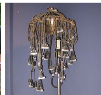
September Early Hair Permer from the Favorites From the History Center Collection Exhibit