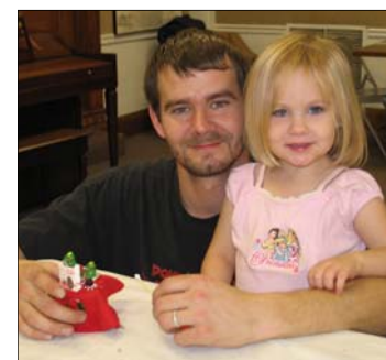
December Children’s Build Your Own Miniature Workshop