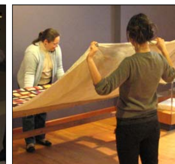
March Installation of the interactive “learn to quilt” section of the The 9 Lives of Quilts .