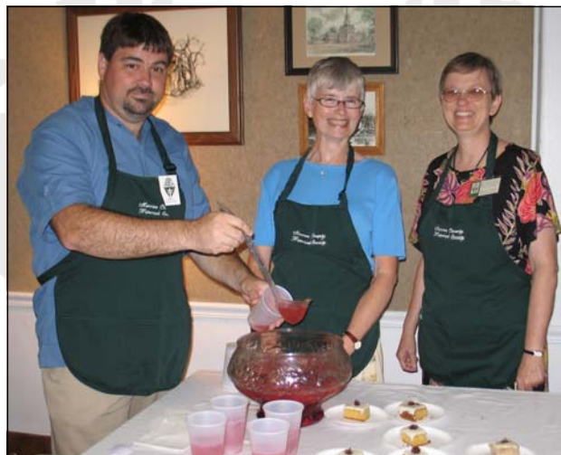
The Center needs help throwing parties too!

We need people to help with our many special events. This position is great for people who work during the day or anyone who likes planning a party.