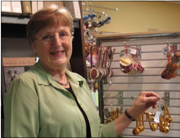
Help in a variety of areas—including the store.

Volunteers are the best sales people. In fact, many Greeters will also help in the store during their shift. Duties include: customer assistance, straightening merchandise, and being a cheerful face.